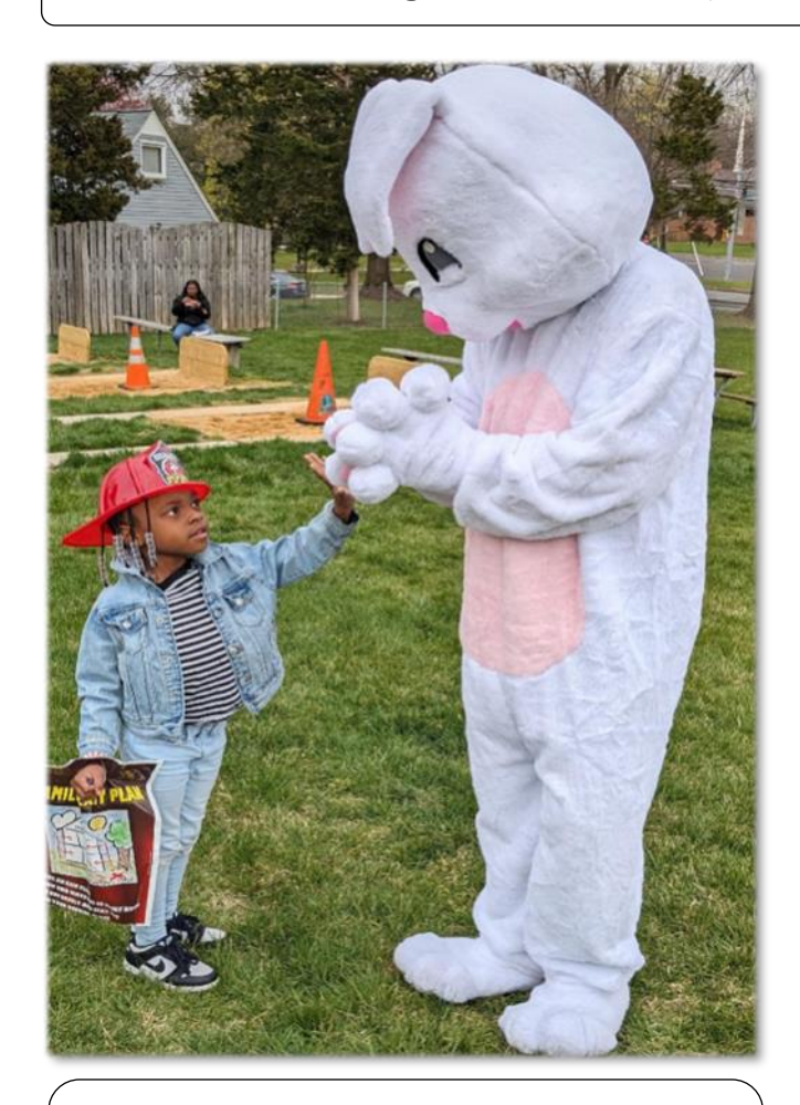
This youngster visited the Easter Bunny after getting his firefighters helmet, compliments of the Greenbelt Volunteer Fire Department.