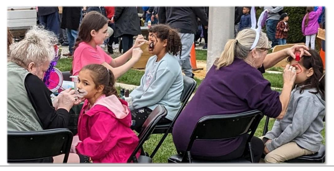
Face painting was a popular activity during the American Legion Easter Egg hunting event.