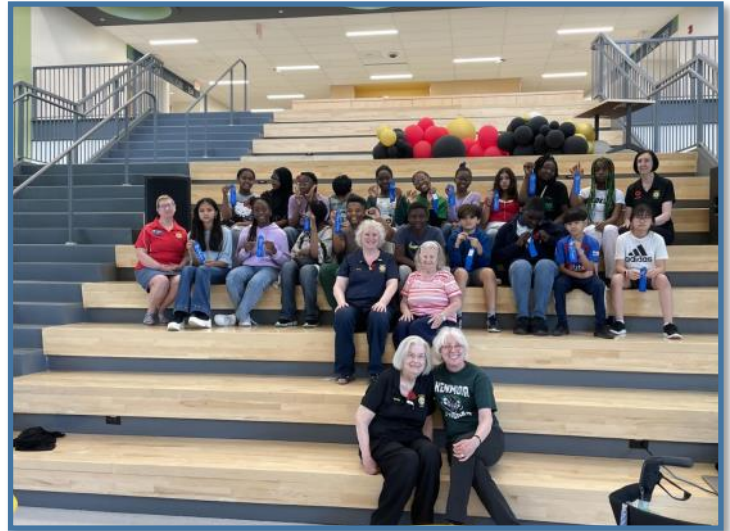
Unit #136 went to Kenmoor Middle School and brought goodies/pizza and gave out the Americanism Essay Contest awards.

Please make checks payable to ALA 136 and include your phone number on your payment.