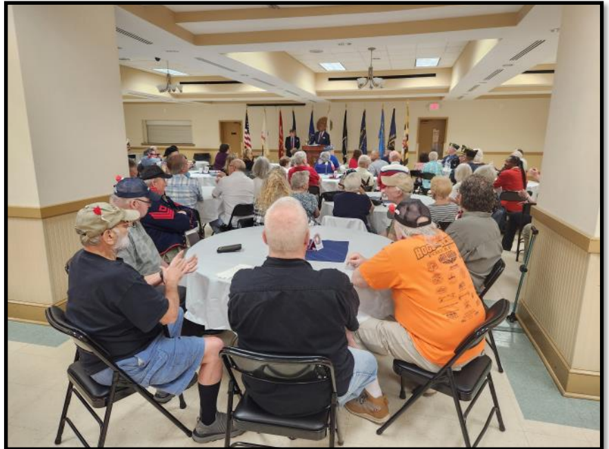
More than 100 participants from Greenbelt and other communities honored deceased veterans at Memorial Day services held at Greenbelt American Legion Post 136.

Story and Photos Courtesy of Butch Hicks (See more photos on page eleven)